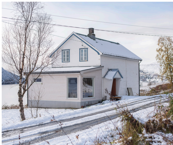
The school house - atelier and exhibition space