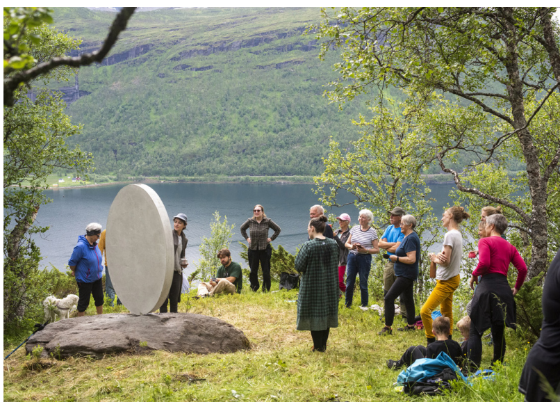
Unveiling the sculpture "High on a rocky ledge" by Ruth Unger in 2024