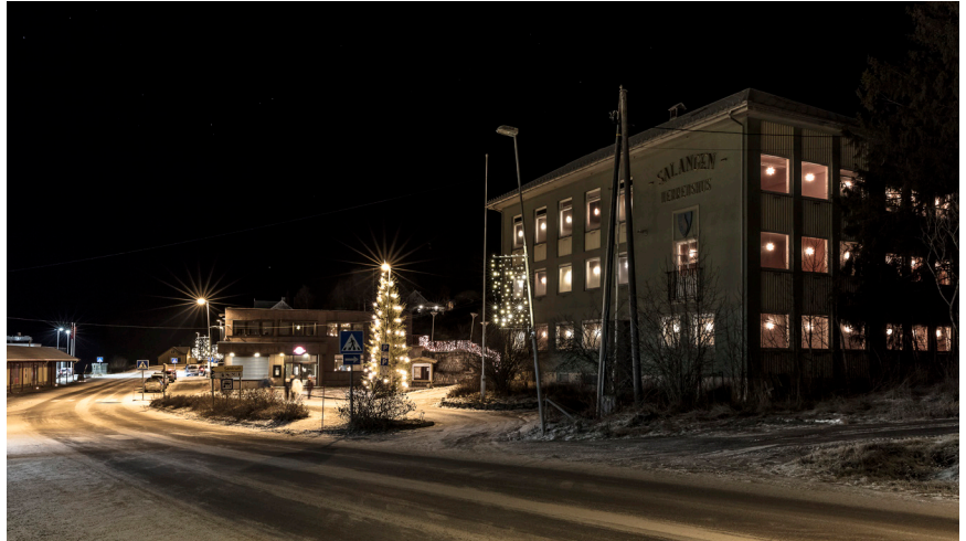
Sjøvegan, Herredshuset during a performance by Selma Köchling & Vidar Laksfors in 2020

Here you find grocery stores, a building material shop, a sports and clothing shop, pharmacy, Vinmonopolet, a shop for farmers and a fantastic hardware store. Two cafes and two restaurants are located at Sjøvegan and a pub is run by volunteers and open every now and then. Sjøvegan also has a doctor's office, school and kindergarden, as well as a branch of the regional historical museum. Several specialist businesses and consultants are available in the local community and can be contacted when specific needs arise. The nearest bigger cities are Tromsø, Harstad and Narvik, reached with public transport within 2-3,5 hours.