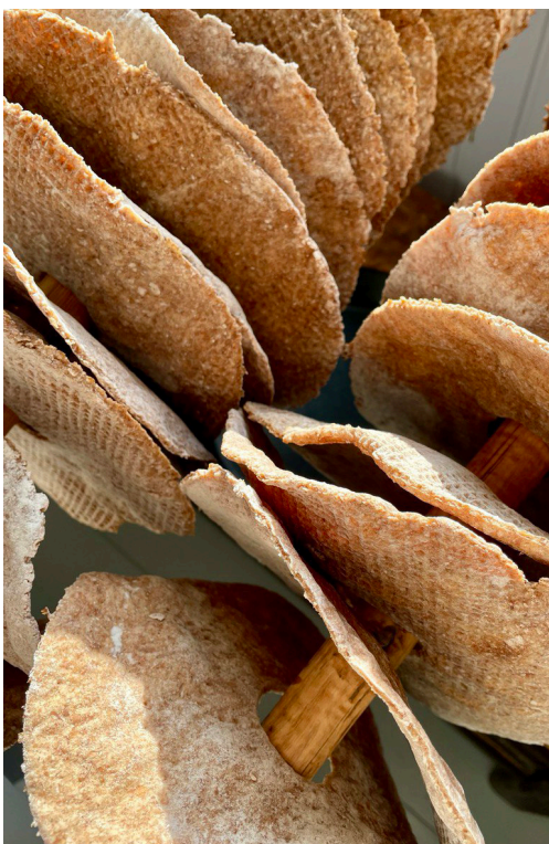
Flatbrød - in STEINSALT exhibition 2024

Lavangsnæs Wunderkammer is a venue for contemporary art, with sculpture park in agricultural landscape, exhibition and production spaces, an architecture agency and a small farm with sheep, chicken and vegetables.