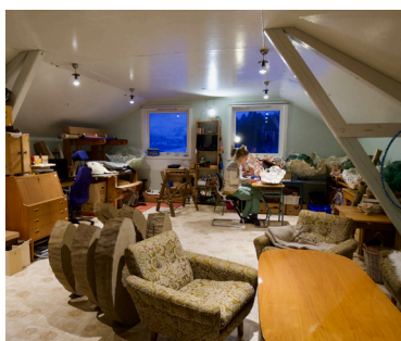
Working space at the school

A boat house, outdoor working space and workshops are related to the farm. Here you will have access to a wide selection of professional tools for working on your projects.