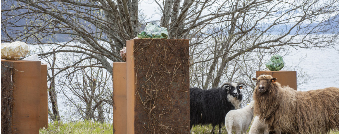
Sheep and sculptures

farm, which will be used as a practical and theoretical starting point for your individual shaping work. Your practical, shaping and theoretical work takes place in dialogue with other professions, like farmers, architect, curator, artist and culminates in a public event and a written document about your process and experience.