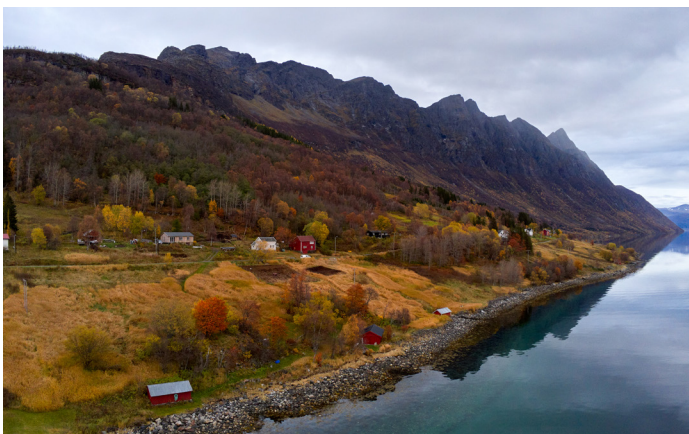
Lavangsnæs Wunderkammer in autumn 2020

Our work is giving a wide audience threshold-free access to cultural experiences in a rural area.