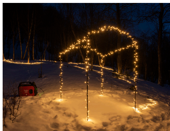
Sculpture "Frame with a view" by Katina Rank with light installation in the sculpture park in vinter 2019

All our residents and cooperation partners will receive an exhibition fee for contributing to public events. This can, for example, be an exhibition, a lecture, a performance, a film or a panel discussion - depending on the outcome of your stay.