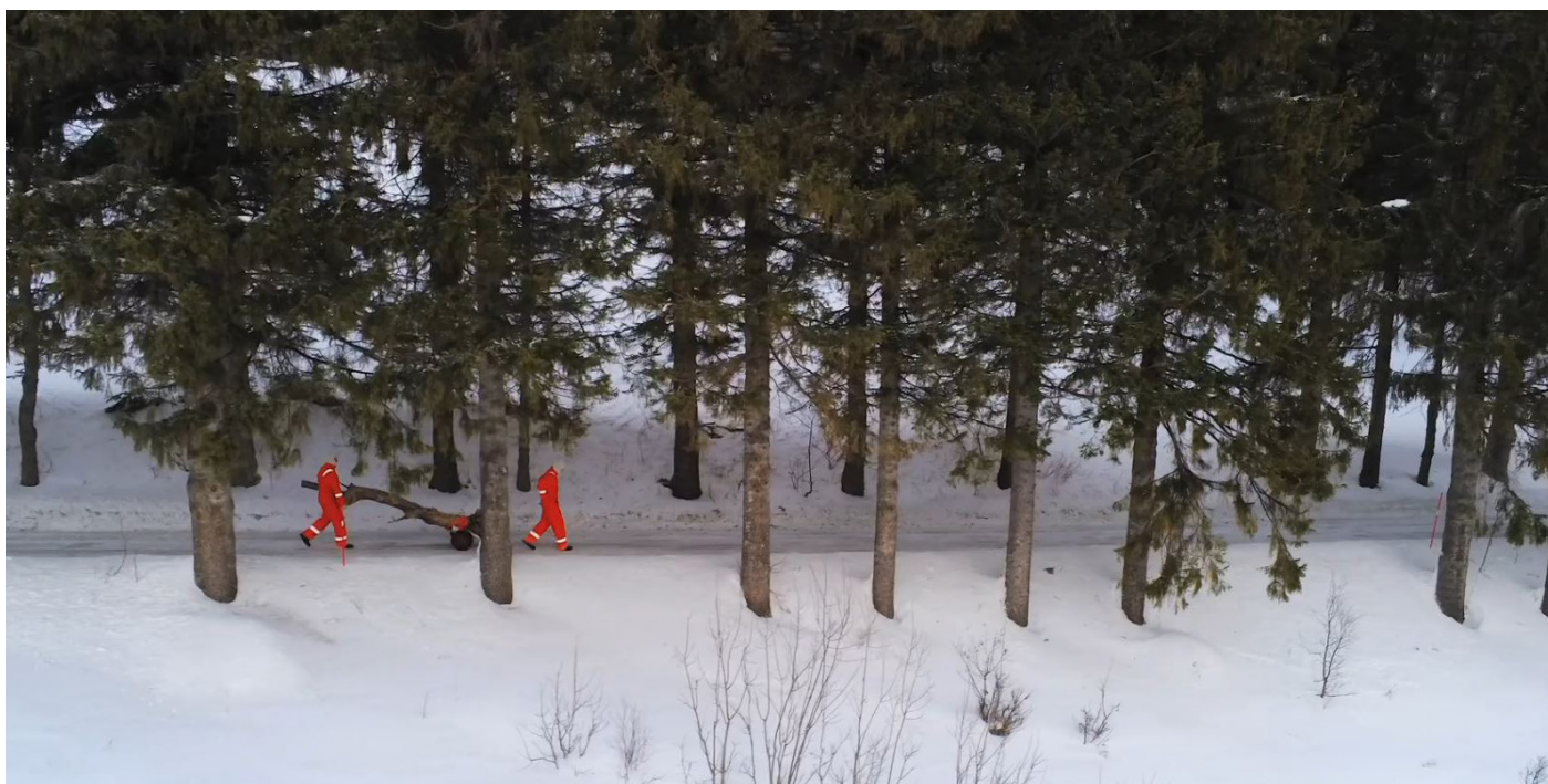
Still from the clip "Transport"

Nearest train station is in Narvik. Check possibilities for train travel here: https://www.vy.no/ we recommend the travel by train via Stockholm. It is a environment friendly and stunning trip. From here you can take the local bus to Sjøvegan, schedule: https://fylkestrafikk.no/meny/planlegg-reisen/ruter-og-reisesok/rutesok-og-reiseplanlegger/ . If you need to be picked up in Narvik, we charge a fee of 850,- kr. Another possibility for train travel is trough Norway to Fauske and from there by bus to Sjøvegan.