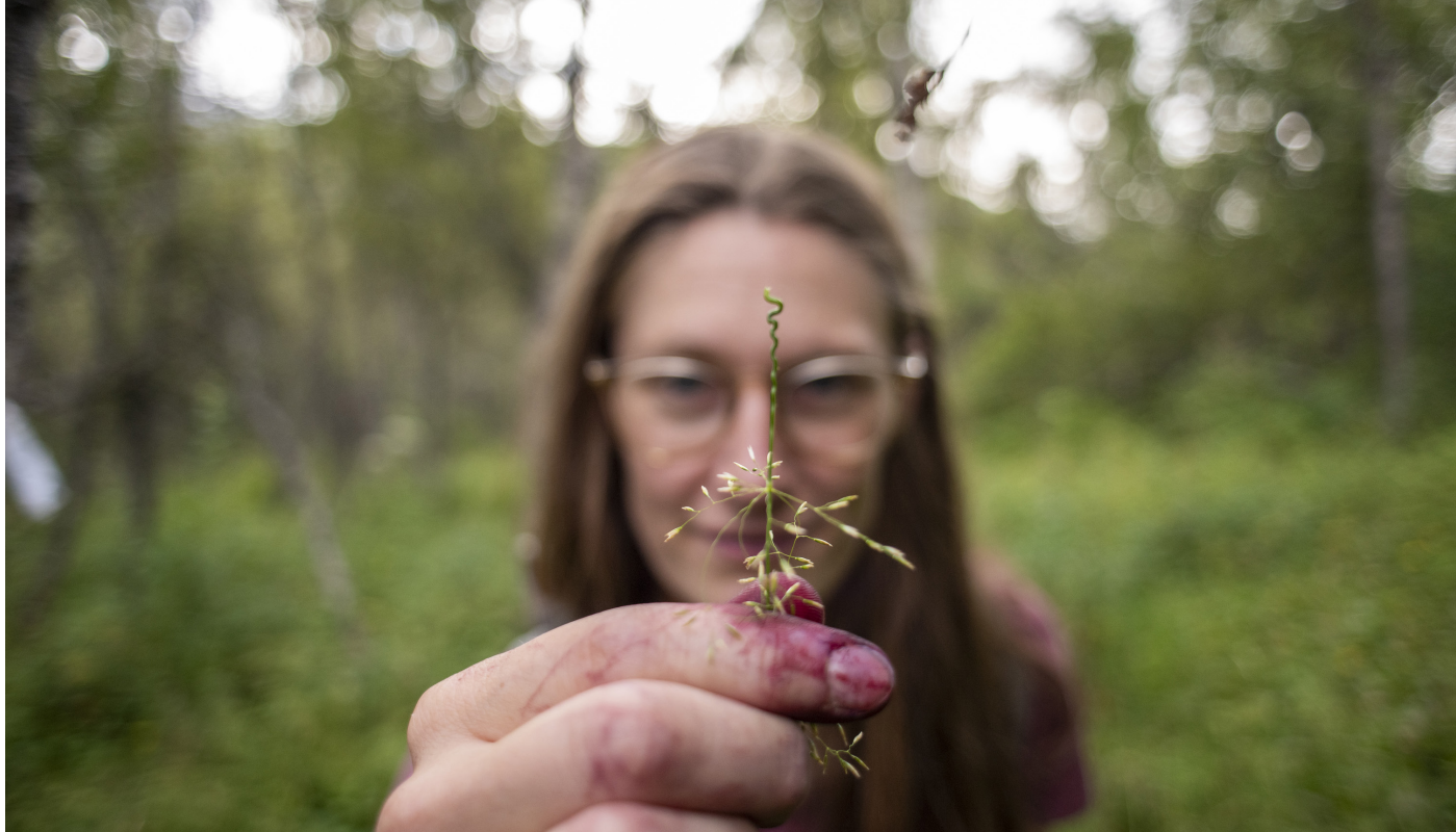
Artist with plant