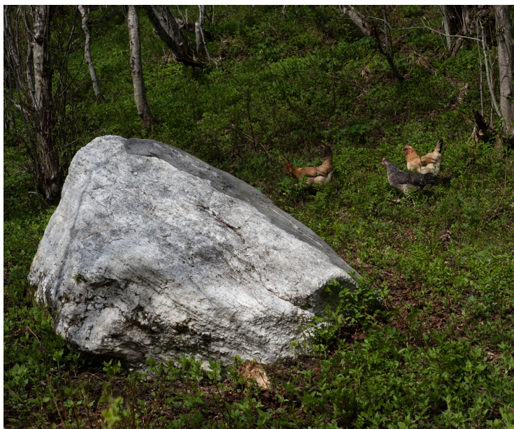
Chicken in the sculpture park

Safe travels, we are looking forward to welcome you!