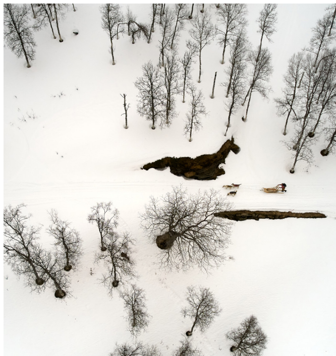
Artist June Mong transports sculptures to Storhaugen by dog sled in 2021

We will also be helpful with a letter of intent and documentation about Lavangnes Wunderkammer which you can use for your individual funding applications to cover daily fee and travel expenses. Earlier residents were supported by national and international funds during their projects here.