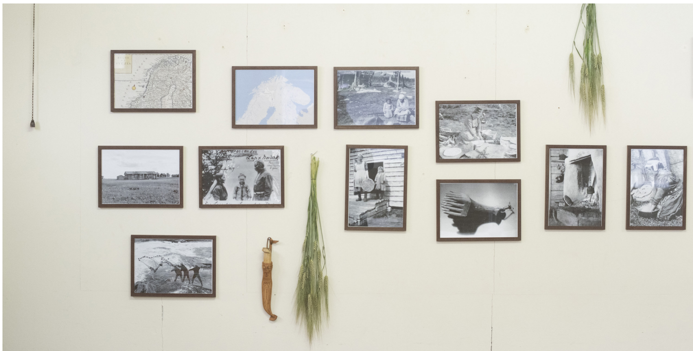
Event NYTTELAST with Eva Saariniemi in 2024