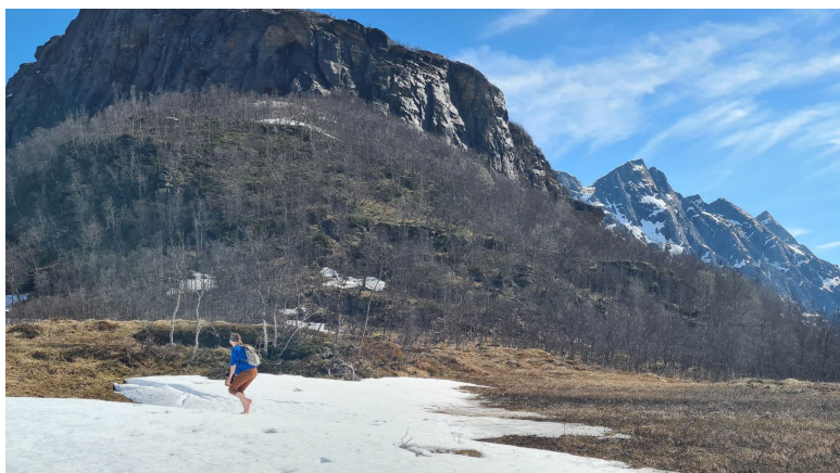
Pedestrian on Stormyra, the highest point of the sculpture park

Several specialist businesses and consultants are available in the local community and can be contacted when specific needs arise. The nearest bigger cities are Tromsø, Harstad and Narvik, reached with public transport within 2-3,5 hours.